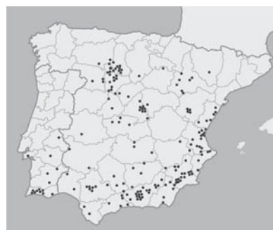
Figure 1. Location of the buildings catalogued up to date and introduced in the data base.

On the other hand, using the database previously created, a first selection of interesting cases was drawn up, which may increase in the future depending on the interest that may be aroused by the new cases introduced in the database. The selection of the first approximately 50 cases was based on: the interest of the building, the interest and importance of the restoration works, the variety of building techniques used, the presence of different interventions carried out at different times, etc. For the buildings selected, a detailed file was drawn up to contain the information necessary to analyse the intervention criteria and techniques and the results of these. The files were drawn up by the architects,