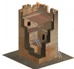
VI. PROJECTS PROPOSALS AND CONSERVATION OF THE TOWERS