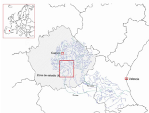
I. AREA OF STUDY- CUENCA DISTRICT-SPAIN